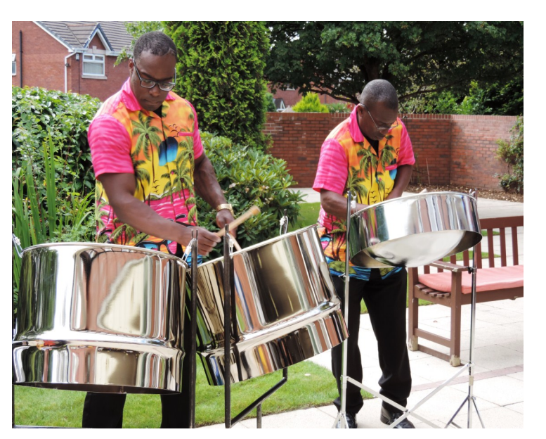
Jamming: Steel Bands kept the crowd entertained at Sycamore Court.

band playing upbeat Caribbean music and the Caribbean food!